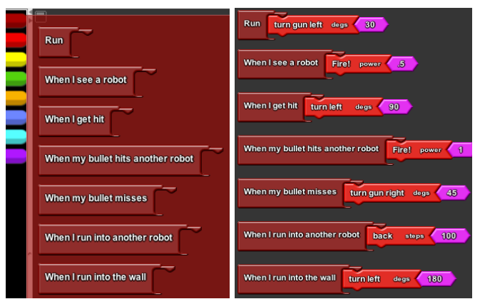
Figure 5. On the left, is the Robot Events drawer; on the right is Beth's first implemented Robot.

Beth then proceeded to go through each of the Game Events blocks (the " dark red buttons " she refers to in the quote), using them as a roadmap to develop her strategy. Fig. 5 shows Beth's first completed robot strategy alongside the Robot Events drawer that lists the available Game Event blocks.