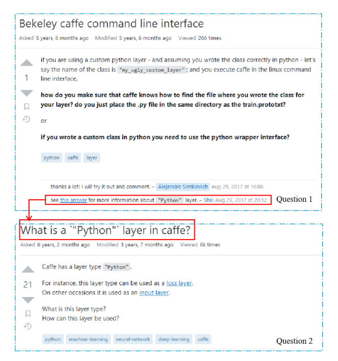
Fig. 1 A sample of related question pair

Stack Overflow is a Programming Community-based Question Answering (PCQA) forum that functions as a platform for developers to seek solutions to programming issues and exchange knowledge in their respective fields. Over time, Stack Overflow has accumulated a large number of questions, with many duplicate and related questions. Figure 1 illustrates an example of a pair of related questions. They are discussing different but related issues, which means that the answers in question 2 contribute to the solution of question 1. It is worth mentioning that typically, developers manually share related questions through URL links, which are identified after the question has been posted. If developers can find related questions when seeking solutions to new issues, they can leverage the existing answers to efficiently resolve their problems. Meanwhile, these available answers enable developers to avoid posting duplicate issues, thereby facilitating the maintenance of the website. The website contains a vast array of questions, and given the possibility of expressing the same question in multiple ways, manual identification methods prove to be inefficient and time-consuming. Hence,