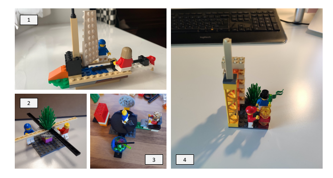
Figure 2: LSP models created by the participants to answer the question "what is agile?".

of different AM elements revealed by the LSP models. As a first step, we used a heatmap for visualization. Figure 3 exemplifies our approach. Lines and columns represent the two LSP workshops and the AM elements, respectively. Each square represents the percentage of participants who mentioned an AM element in the LSP model, with larger values represented by darker squares. This way, the two lines of the heatmap reveal the AM in the group of participants of the two LSP workshops.