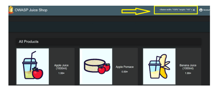
Fig. 2. The malicious script is entered into the search field

or processes that lead to failure can guide future software engineers on what to avoid. Anti-patterns can help developers capture the causes of security vulnerabilities in architecture, design, or source code. Dougherty [8] discussed the need for anti-patterns to describe bad decisions, causing software security failures in a formal way. Nafees et al. [12] proposed the format of documenting vulnerability into anti-patterns.