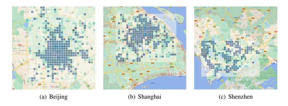
Fig. 4. Beijing, Shanghai and Shenzhen Prediction Map

At the same time, according to the results of city similarity distribution, six representative city data are selected to train the transfer learning model. The experimental results show that the urban data transfer learning effect and source The results also verify the correctness and effectiveness of the proposed method.Finally,a visualization system of urban hotel development trend prediction algorithm is designed and implemented.