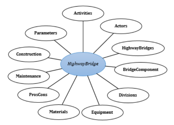
Figure 2. The high-level class hierarchy of HiBrinto ontology

At the end of the data collection, the taxonomy for HiBrinto was created. Eleven super-classes were identified; Activities, HighwayBridges, BridgeComponent, Actors, Divisions, Equipment, Materials, ProsCons, Maintenance, Construction, and Parameters. The sub-classes for the superclasses are also identified. For example, "EnvironmentalConcerns", "OualityCheck", "Duration", "MaintenanceTechniques", "RepairTechnique", "ManagementPractices" are sub-class of "Maintenance" class. Further, the "QualityCheck" class contains "QCCode" and "QCItem" as its sub-class. The high-level class hierarchy of HiBrinto ontology is shown in figure 2.